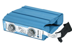
Wedge & Wedgekit